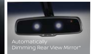
Automatically Dimming Rear View Mirror*