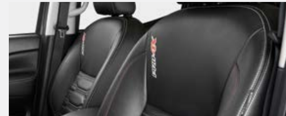
BLACK LEATHER SEATS (PRO-4X Model)