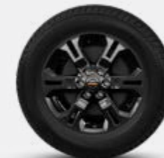
17" ALLOY (PRO-2X and PRO-4X)

Nissan's commitment to quality: To provide all customers with a consistently high level of quality, Nissan applies the same standards worldwide, to ensure that all Nissan owners enjoy peace of mind for the lives of their vehicles. The approach is based on quality from the customer's perspective on three key elements: First, the expectation of a smooth driving experience with complete peace of mind. Second, the intangible appeal of a vehicle, its power to captivate and excite, with features that capture attention and imagination. Third, the level of attentiveness and service during the sales process, and long after the sale is concluded.