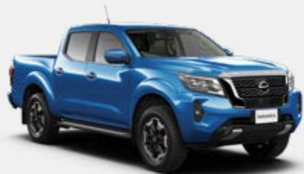
Blue (M) - B16