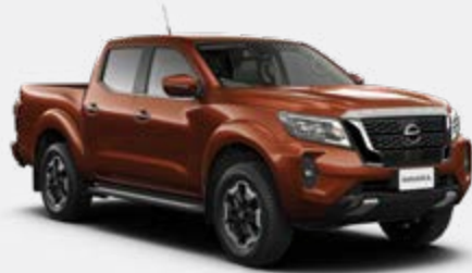
Forged Copper (M) - CAU