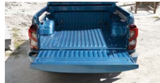
LOAD BOX FLOOR LENGTH

Special focus has been placed on towing and payload, so the new Navara features a stronger rear axle to allow for heavier loads with even more confidence. To accommodate the more powerful engine plus greater towing and payload capabilities, the rear brake size has been increased to reduce fade and provide more balanced stopping power.