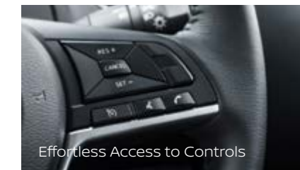
Effortless Access to Controls

Navara maximises storage inside and out. The rear seats feature secure under-seat storage and boast the ability to remain conveniently flipped up to help transport taller items.