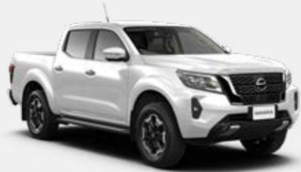
White (S) - QM1