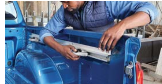
UTILI-TRACK CHANNEL SYSTEM

Gone are the days where a choice has to be made between hardworking and good looking. The all-new Navara boasts extensive range model depth, catering for every driver need and requirement, with several model and grade options across the board. The LE Model offers exceptional levels of bold and dynamic styling, with generous levels of premium interior comfort, safety and connectivity technology; without compromising on tough hardworking credentials to tackle the harshest African conditions.