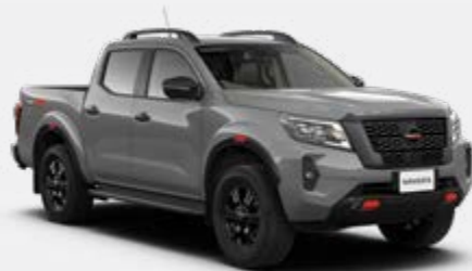
Warrior Grey (PM) - KBY Available on PRO-2X and PRO-4X only