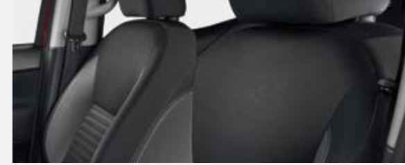
CLOTH SEATS (LE, SE Plus, SE and XE* Plus Single Cab Model) *Grey vinyl option available for XE Single Cab only