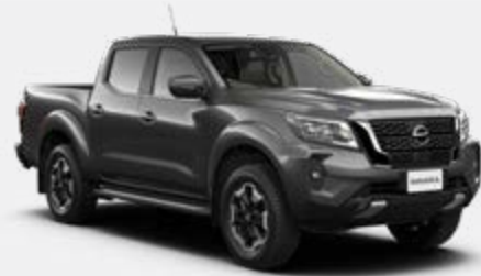
Techno Grey (M) - KY5