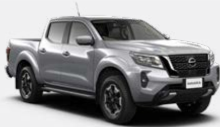
Silver (M) - KYO