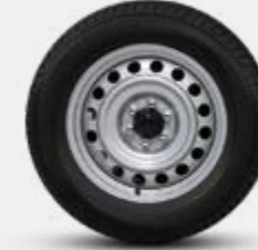
16" STEEL (SINGLE CAB)