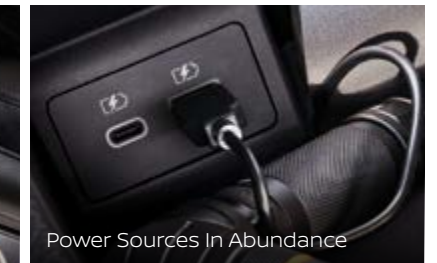
Power Sources In Abundance