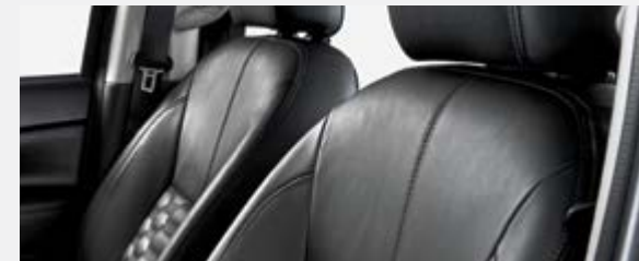
BLACK LEATHER SEATS (LE Plus Model)