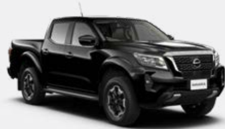
Infinite Black (S) - KH3