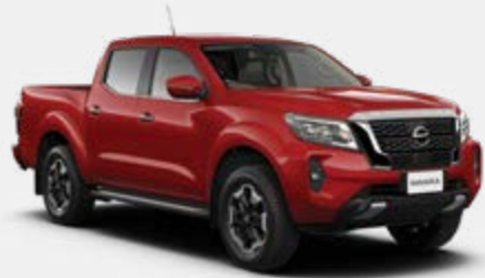
Red (S) - AX6